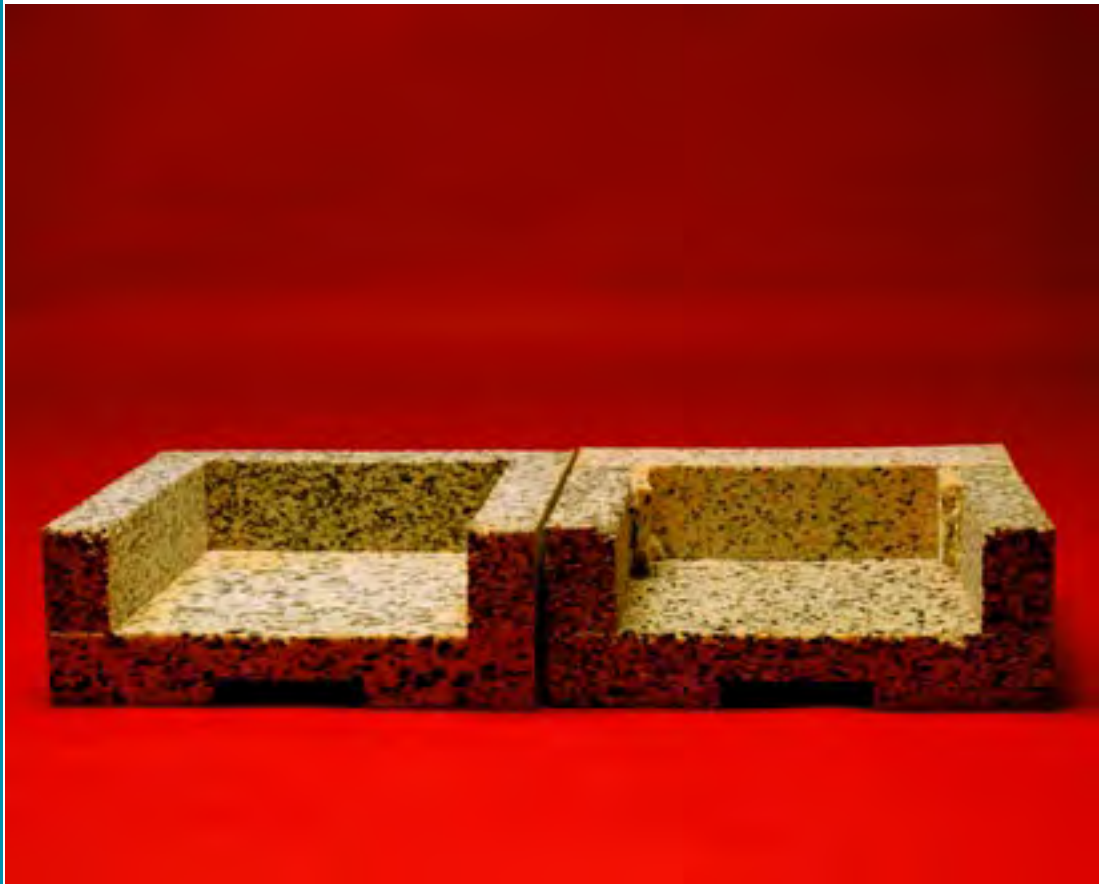
Vanila Netto Mini-Flex Super-Comfort , 2003-4, digital print on aluminium, 75 x 93 cm, 1/5. Collection Rachel Verghis

“I am interested in subverting the symbolic power of goods and utility by making photographs that suggest alternative systems, where modest, underrated sources are invested with unusual functionality and nobility. The human figure and selected discarded objects or materials are reconfigured to emphasise the intense, the unexpected, and the unusual in simple, improvised interventions.”