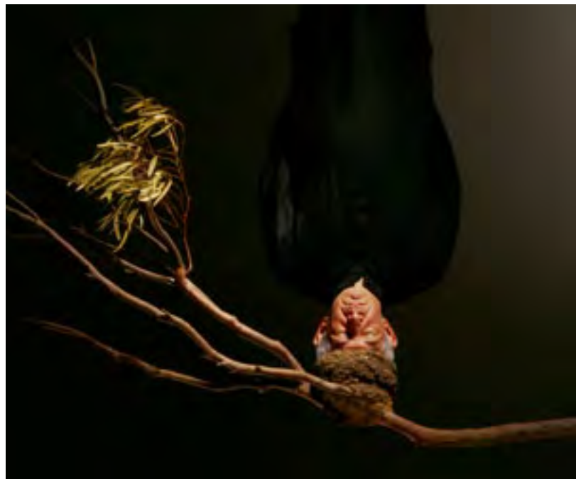
Hossein Valamanesh Nesting , 2005, digital print on watercolour paper, 113.5 x 135 cm, 4/5. Collection Rachel Verghis