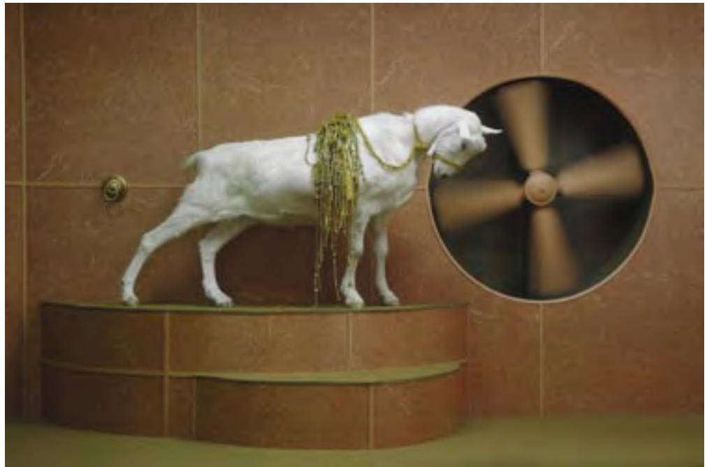
Hayden Fowler Goat Odyssey , 2006, digital video, 16:9 format, sound, colour, single channel, 15:10 loop, 61/70. Collection Rachel Verghis

Newell Harry Beginnings and Endings/Endings and Beginnings , 2008, neon (Helvetica, snow white), 10 x 330 cm, 2/5 + 2 AP.