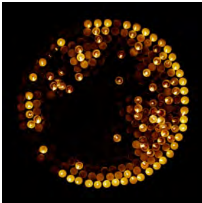
Shoufay Derz Radii Heart (340/360) , 2004, Lamda print, face mounted on acrylic, 80 x 80cm, 1/5. Collection Rachel Verghis

Vanila Netto Normal distraction from good conversation part 3 , 2002, digital print, 85 x 100cm, 5/5.